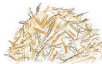
Mini haystack of collected grasses