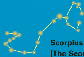
Scorpius (The Scorpion)