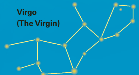
Virgo (The Virgin)