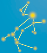
Canis Major (The Greater Dog)